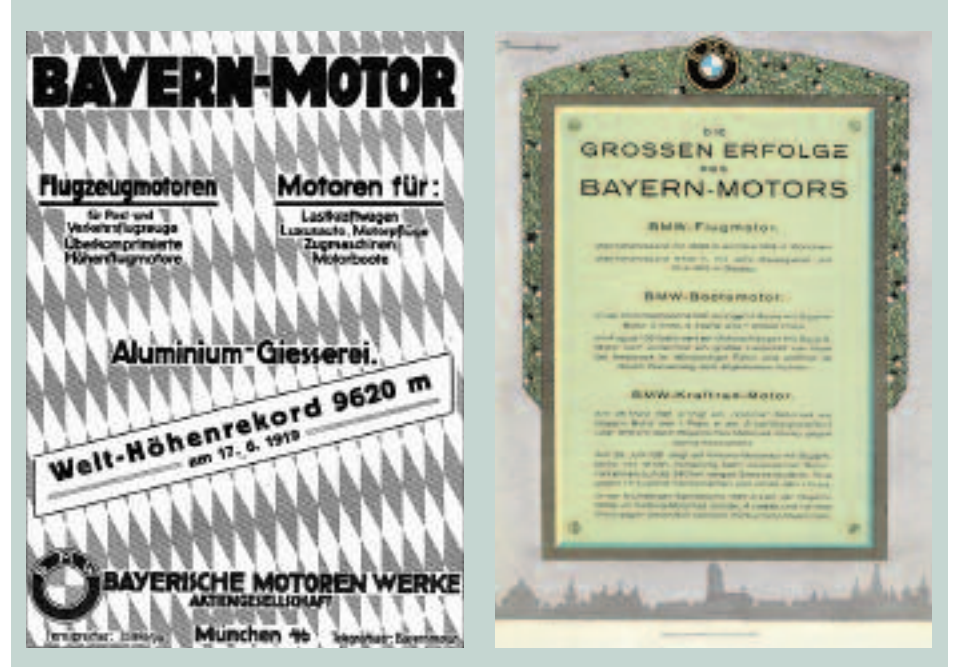
BMW advertised its first products under the brand name "Bayern-Motor", which would be officially entered into the register of trademarks. However, it was rejected by the Patent Office in 1919. Nevertheless, BMW continued to use the name until 1921 – further evidence of the fledgling company's close allegiance with Bavaria.

receivables, as well as the workforce. Bayerische Motoren Werke GmbH therefore perceived itself to be the successor to Rapp Motorenwerke GmbH, and the predecessor company also impacted on its choice of a new name. Taking the logo of the Rapp Motorenwerke as a model was therefore a logical step when designing the company logo and trademark of Bayerische Motoren Werke.