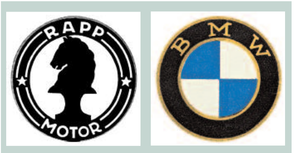
Logo of Rapp Motorenwerke GmbH (1913–1917) and logo of BMW GmbH (October 1917).

In fact, the propeller myth only surfaced as late as 1929. It's likely that the new interpretation was intended to support the marketing efforts for the aeroengine product range. However, the fact is that this interpretation has developed its own authority and tradition by virtue of being recounted and disseminated over a period of 75 years.